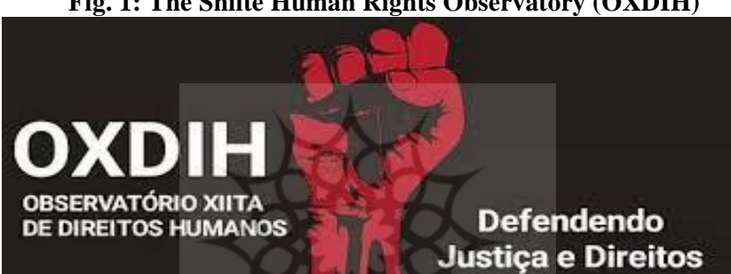
Fig. 1: The Shiite Human Rights Observatory (OXDIH)

The OXDIH then renumbered as an organisation recognised by the Committee of combating religious intolerance do Estado do Rio de Janeiro (CCIR), one of main committees ofsocial action against discrimination and listed on the page of the Public Ministry of the State of Rio de Janeiro (MPRJ).